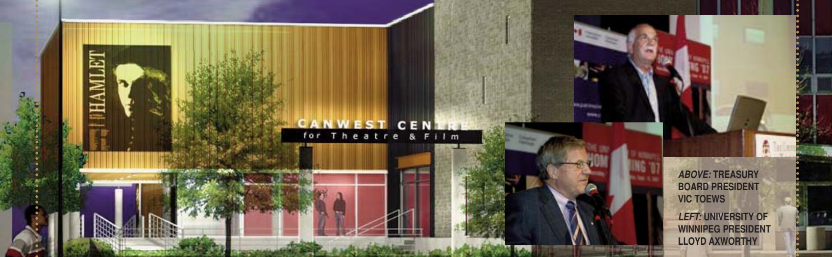
ABOVE: TREASURY BOARD PRESIDENT VIC TOEWS